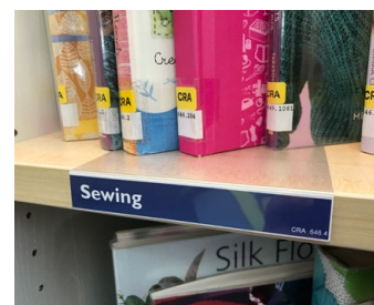
Shelf ID Plate (130mmW x 18mmH)

Please note: All signage/graphics are based upon the Pantone colour system.