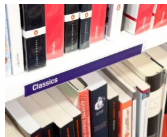
Adhesive Shelf Guide (250mmW x 18mmH)