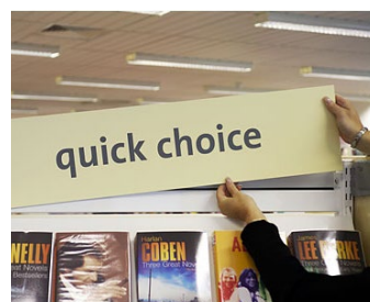
Magnetic Header (Shelf Width x 250mmH)