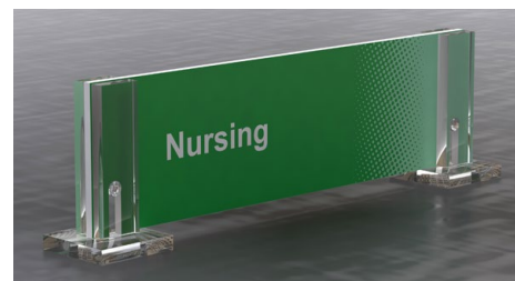
Henry (360mmW x 100mmH) Graphic style - "Gradient"