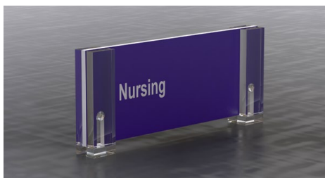
Spinner Ian (260mmW x 100mmH) Graphic style - "Standard"