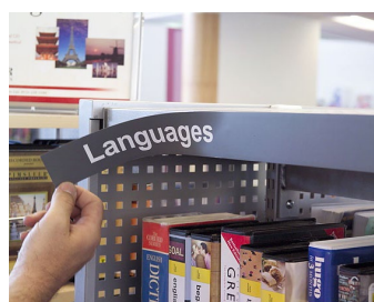
Magnetic Canopy Guide (Shelf Width x 70mmH)