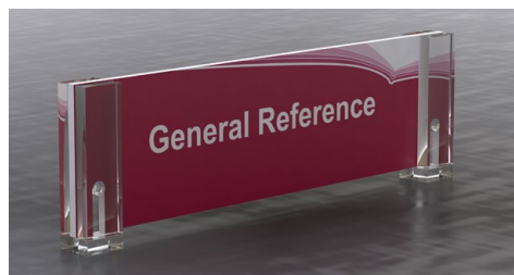
Ian (360mmW x 100mmH) Graphic style - "Open Book"

Sign size indicates graphic insert only, holders are additional. Suitable for either steel or timber canopies.