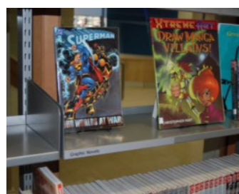
Magnetic Shelf Guide (250mmW x 18mmH)