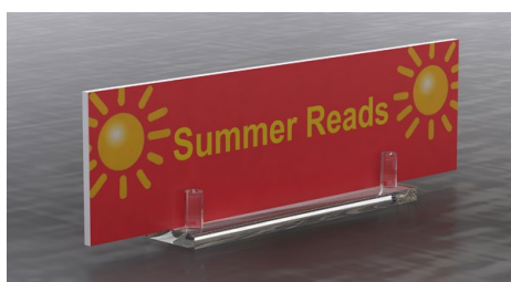
Peggy (360mmW x 100mmH) Graphic style - "Sunny Reads"