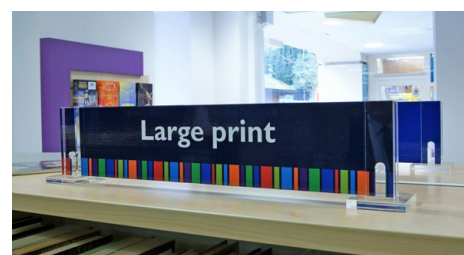
Custom (360mmW x 100mmH) Design your own header graphic!