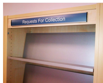
Aluminium Slat Header (600mmW x 50mmH)