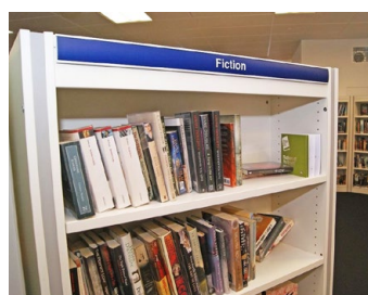
Plastic Slat Header (Shelf Width x 50mmH)