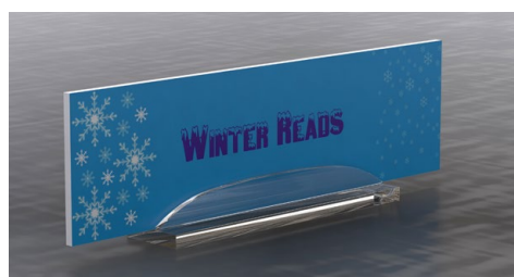
Archie (360mmW x 100mmH) Graphic style - "Winter Reads"