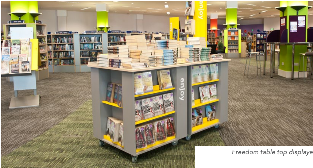
Freedom table top displayer