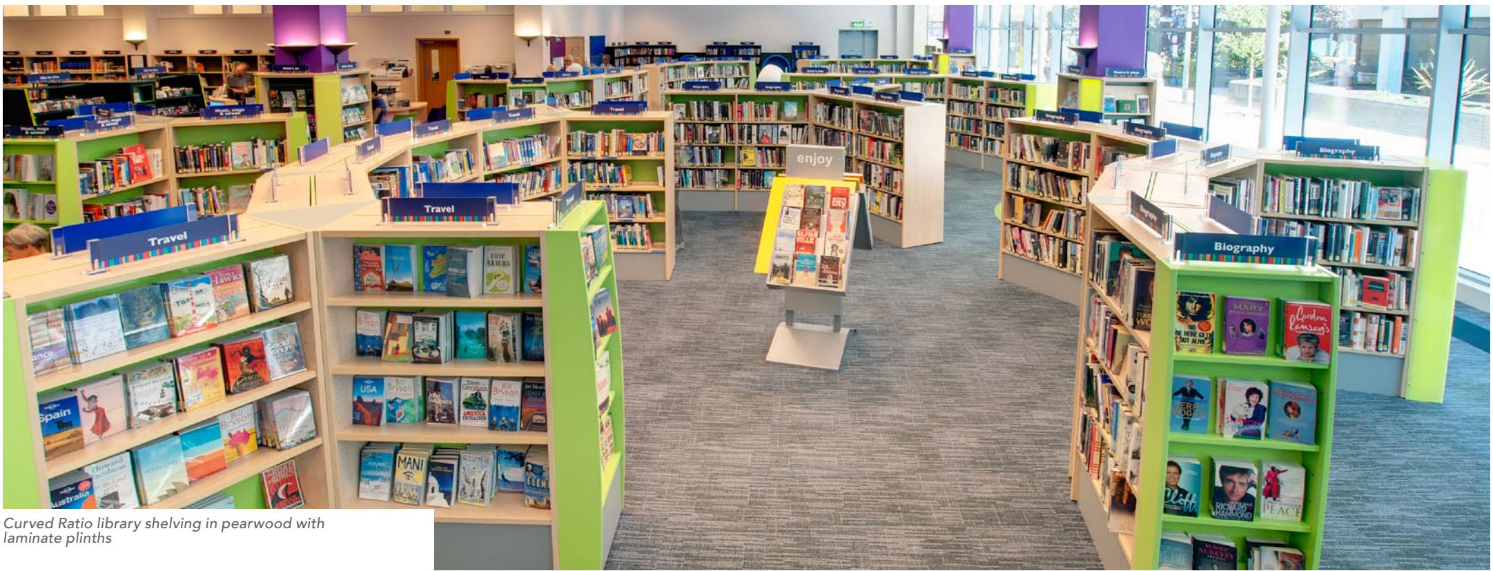
Curved Ratio library shelving in pearwood with laminate plinths