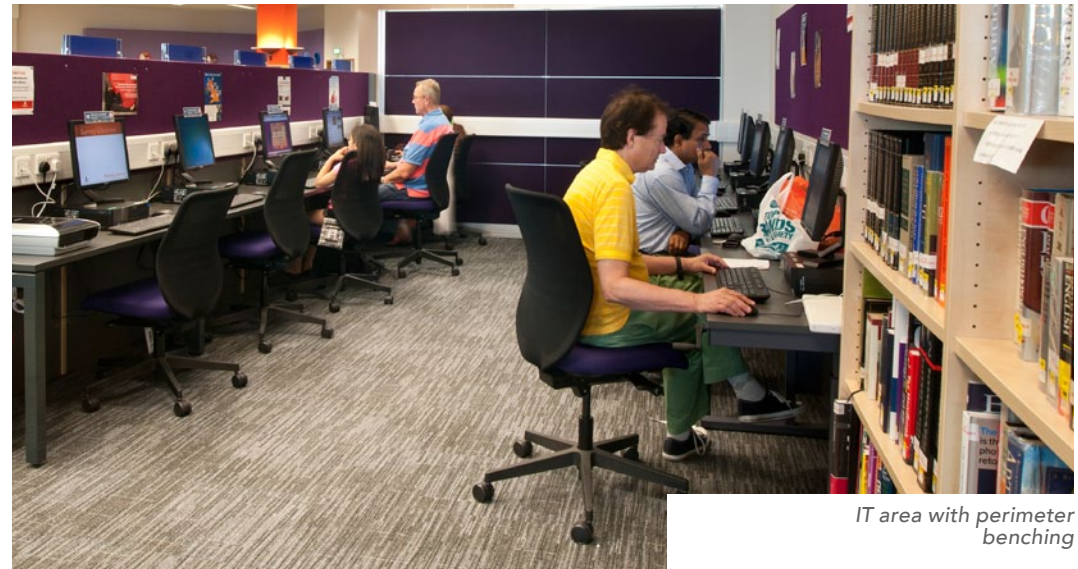
IT area with perimeter benching