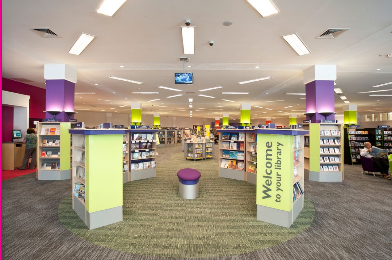
Ratio library shelving in Pearwood with green illuminated acrylic end panels