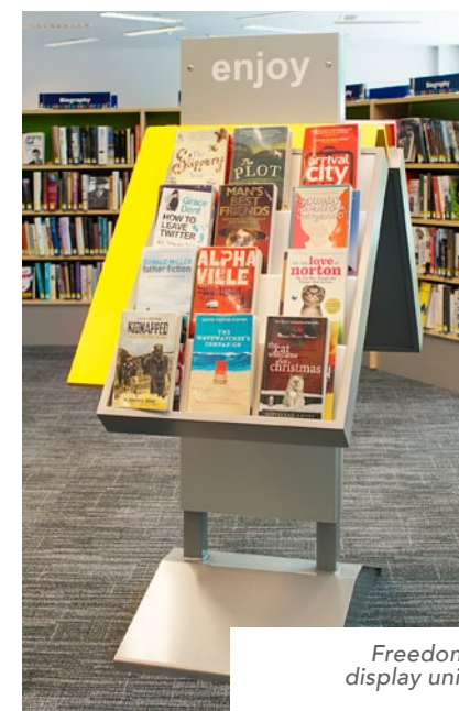
Freedom display unit