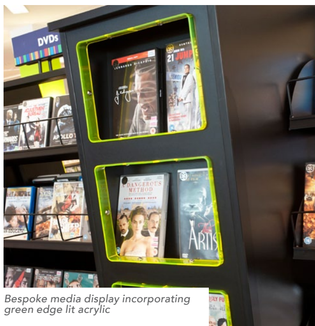
Bespoke media display incorporating green edge lit acrylic